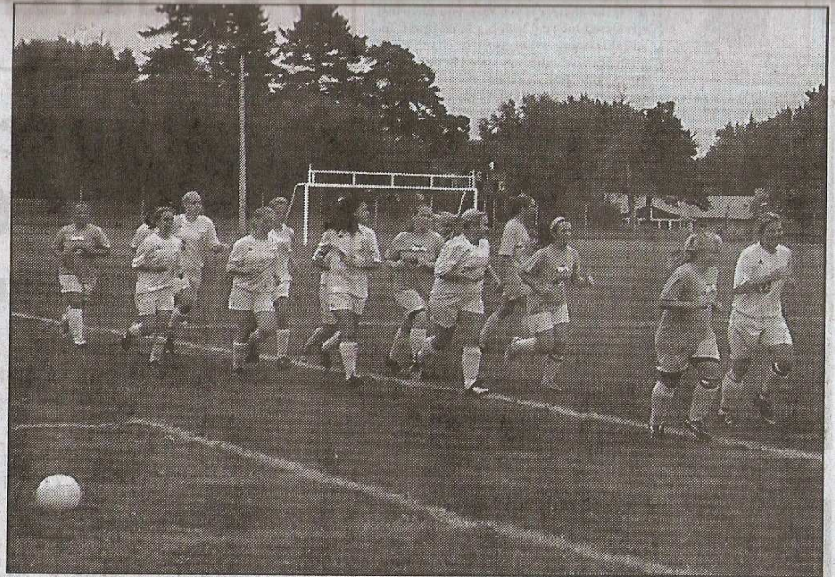
The Girard girls Junior Varsity soccer team warms up before their scrimmage. The girls scrimmaged Edgewood Saturday afternoon.

"We are not so worried about the score in our first couple scrimmages, because we split the time up be-